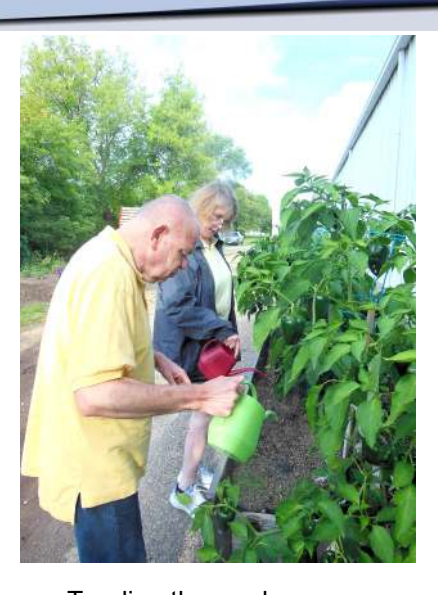
Tending the garden